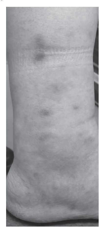
Fig. 1 Subcutaneous nodules.

reactions mediated by immune complexes are assumed. However, this theory was formed by analogical inference drawn from the pathology of systemic PN. As described below, the background for the pathogenesis of CPN may differ from that for PN. Therefore, the pathogenesis of CPN should be evaluated in terms of not only allergic reactions but also circulatory or vascular impairment. Although the cause of CPN is unknown, the involvement of streptococcal infection and hepatitis virus infection has been suggested. However, at least in Japan, there have been few results suggesting an association with HBV or HCV infection.<sup>6</sup>