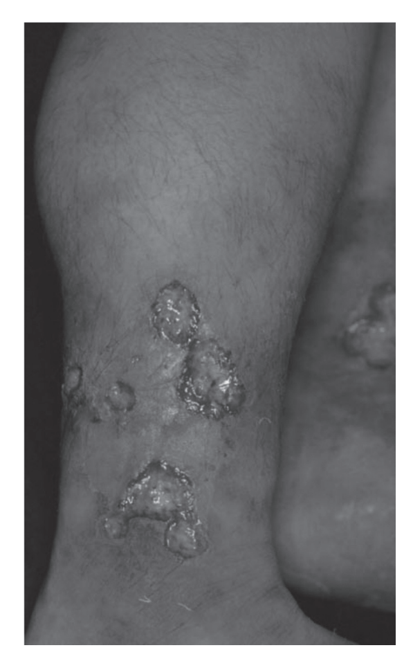
Fig. 2 Ulcer.

In the dermatological field, CPN shows a prolonged course with repeated skin manifestations, but is generally considered to be distinct from PN due to its favorable prognosis. However in other departments such as the Department of Internal Medicine, the characteristics of CPN are not adequately understood. This is because of the lack of diagnostic criteria or evidence and inconsistent interpretation of neurological findings.